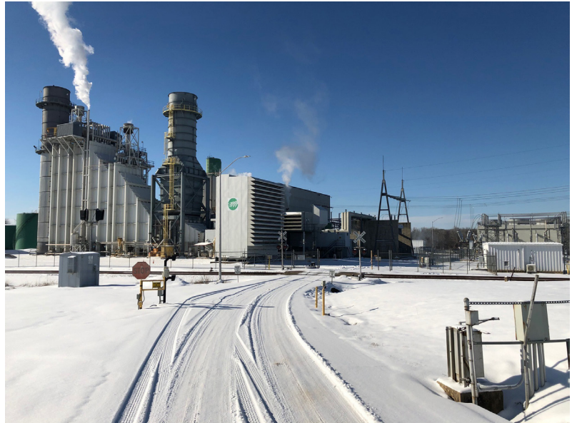
The Thomas B. Fitzhugh Generating Station operated on fuel oil reserves at the peak of the severe winter temperatures to shield electric cooperative members from skyrocketing natural gas costs.

To help minimize the fuel cost impact, AECC's board of directors approved a plan to recover these costs on member bills over the next nine months. These costs are part of the